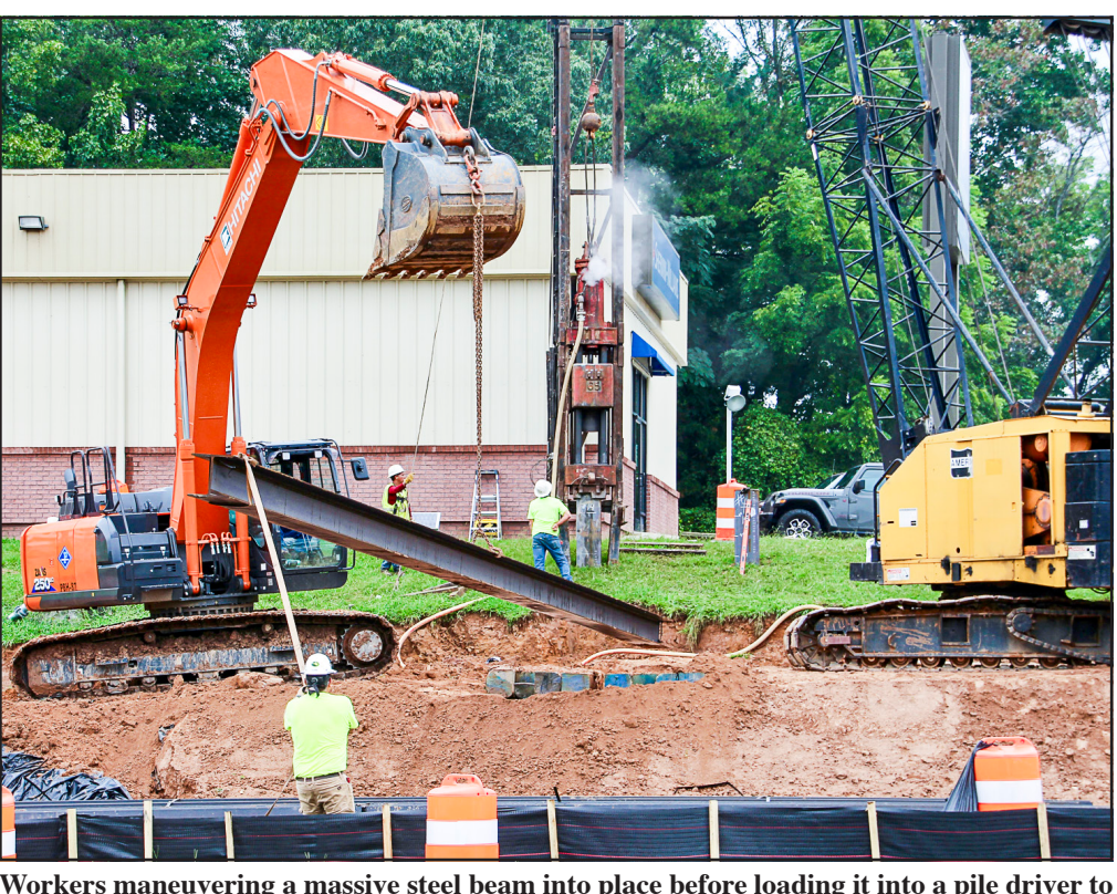
Workers maneuvering a massive steel beam into place before loading it into a pile driver to shore up dirt near the Murphy Highway/515 sinkhole.

Conley said. On the other side of 515, the city will continue pumping sewage from the manhole behind First Baptist to another one up the street.