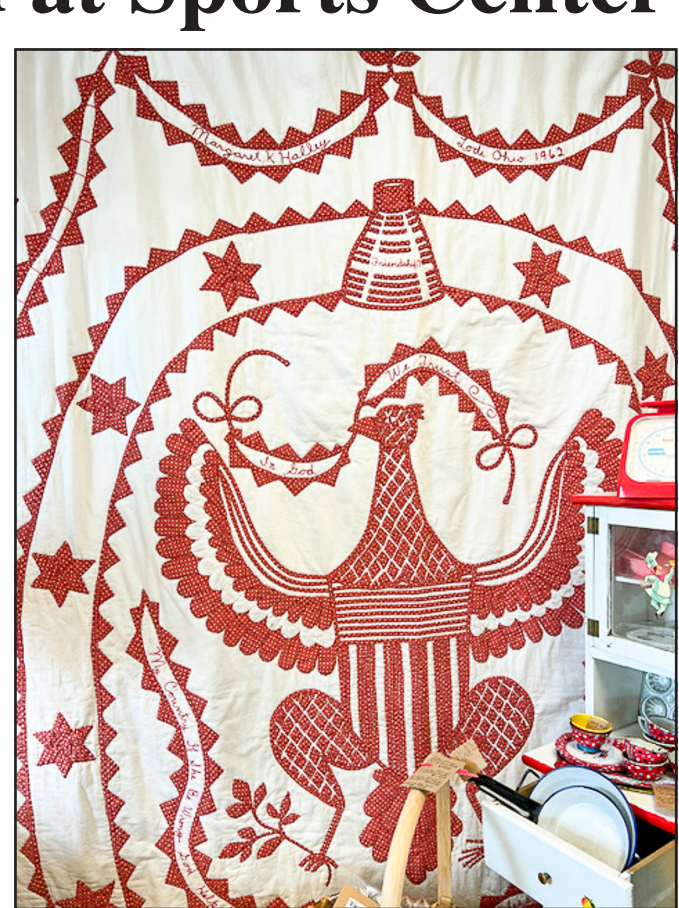
This 1960s vintage quilt from Linger Awhile Antiques in Murphy, North Carolina, will be on display at QuiltFest.