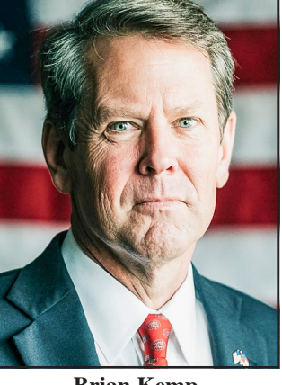
Brian Kemp Georgia Governor

of regular gas in Georgia is currently $3.57, up from $3.24