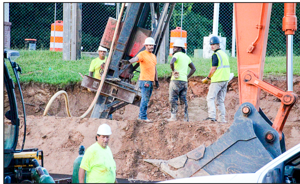
GDOT and Pittman Construction crews continued work on the extensive sinkhole repair last

Erosion control has been restored sewer service Friday put in place at the site, and to the Shell and paint store pumps have been installed to by connecting a new line to a See Sinkhole Repair, Page 6A